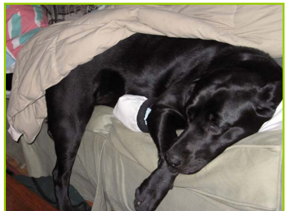
And of course the ruler of the roost....